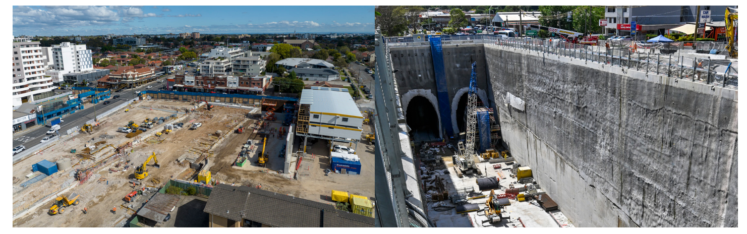
Burwood North site before major excavation started (August 2022).