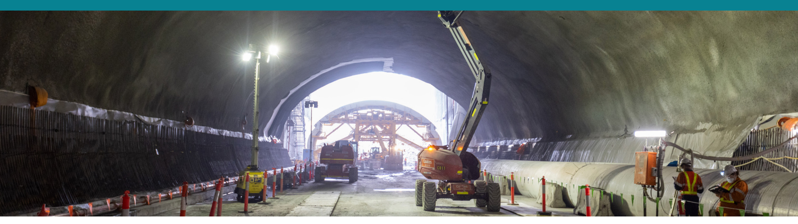
Burwood North crossover cavern.