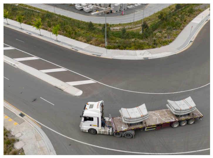
Concrete segment delivery from Eastern Creek Precast Facility.

A copy of the consistency assessment for these tunnelling support activities is available in the document library on the Sydney Metro website.