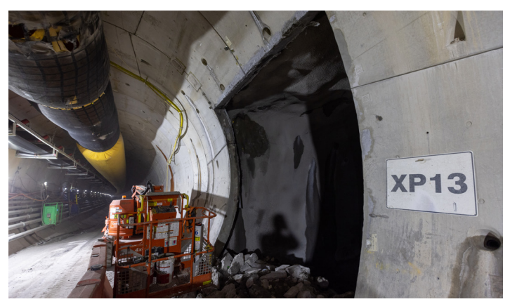
A cross passage connecting the two metro tunnels under Rozelle.

Residents will be notified ahead of the TBMs approaching their property for each of the tunnels and then again before cross passage excavation starts. AFJV has undertaken extensive noise and vibration modelling to predict the likely impacts of tunnelling and ensure they are within acceptable limits. Regular monitoring will continue throughout the project to ensure noise and vibration is within the expected levels.