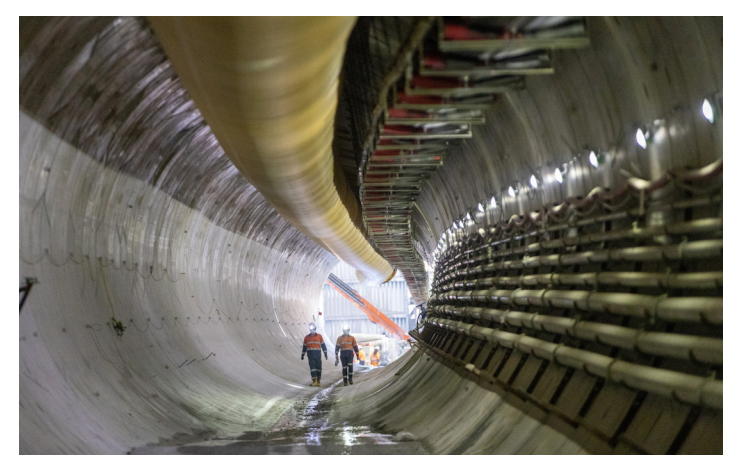
Conveyor structures and service pipes.

To give peace of mind to local residents and businesses, all properties 15 metres from the outer edge of the underground tunnels will be offered a free property condition survey before and after tunnelling work occurs in the area. A letter of offer is sent to eligible property owners around three months before the first TBM is expected to arrive.