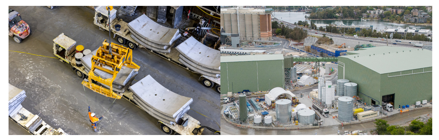
Multi service vehicles moving concrete segments.